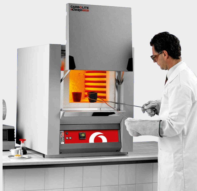
CWF 12/36 with PC3016P1 programmer option