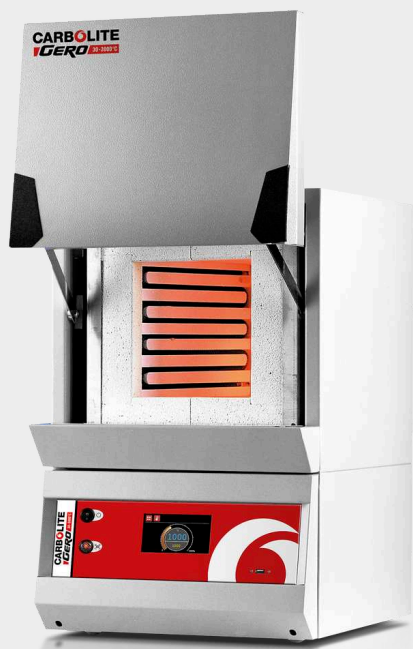
CWF 11/13 with CC-T1 programmer option