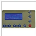
LCD Display Airflow velocity, UV timer, UV work time, system work time, real time.