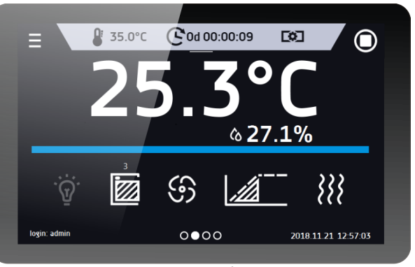
Smart PRO - preview screen