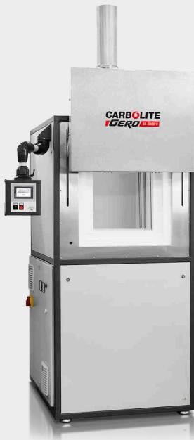
HTF 17/64 with debinding option incl. active propane afterburner and Mini8 touchscreen controller