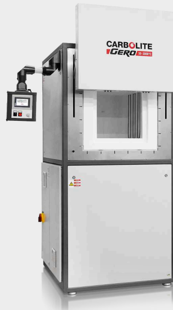
HTF 17/64 with Mini8 touchscreen controller